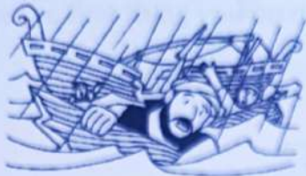
From The Complete Bible Story (By Art Park. Copyright Light: Used by permission)